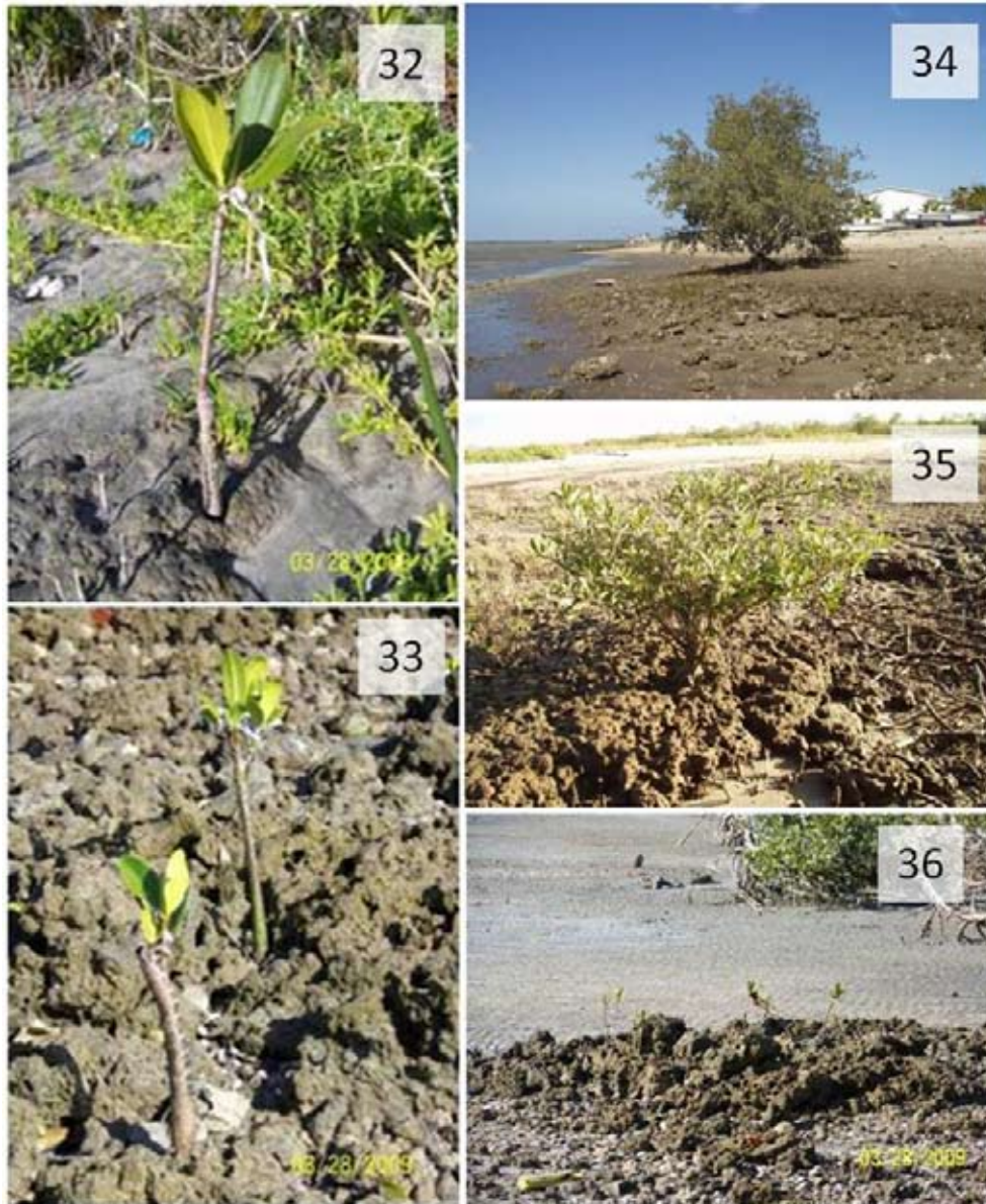
Figures 32-36. Associations between mangroves and different stages of thrombolite formation in B.C.S., Mexico: 32) Black mangrove ( Avicennia germinans ) anchored on thrombolitic platform (La Paz lagoon); 33) White mangrove shrub ( Laguncularia racemosa ) anchored on pro-thrombolitic platform (El Mogote, La Paz lagoon); 34) Recruits of red mangrove ( Rhizophora mangle ) anchored in soft conglomerated mat at San Carlos; 35) Recruits of red mangrove ( Rhizophora mangle ) anchored in thrombolith outcrop at San Carlos; 36) Rhizophora mangle recruits anchored in thrombolitic platform surrounded by sand with no recruits at San Carlos.

(2006) have suggested that during the Pre-Cambrian, stromatolites and hence microbial mats had covered large areas. These may be represented by rocky ground far from the coast and living stromatolites in the intertidal, but also by extensive (non consolidated sediment) pro-thrombolitic platforms and thrombolites in coasts. Therefore, extensive microbial mats such as those shown in Stal (2000) and here in figure 2 may have developed into conglomerated mats and pro-thrombolitic ground that eventually was to