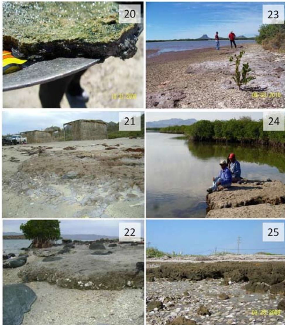
Figures 20-25. Pro-thrombolitic structures in other localities of the Gulf of California, Mexico: 20) Thick cyanobacterial mat from the intertidal of Isla San José; 21) Pro-thrombolitic muddy platform at El Requesón, Bahía Concepción; 22) Lithified thrombolitic platform and Laguncularia racemosa specimen; 23) Thrombolitic platform at Estero El Soldado, Sonora; 24) Seri natives seating on a thrombolitic block in Estero Santa Rosa, Sonora; 25) Thrombolite platform and fragments in the upper intertidal area of San Carlos beach, Bahía Magdalena, west coast of B.C.S.

La Paz lagoon (Siqueiros-Beltrones, 2008) where environmental conditions are much alike. Mineralogical analyses indicate that grains from San Carlos are probably formed under marine conditions and the acid treated samples show a similar degree of selection indicating that they come from sites under similar (low) energy conditions.