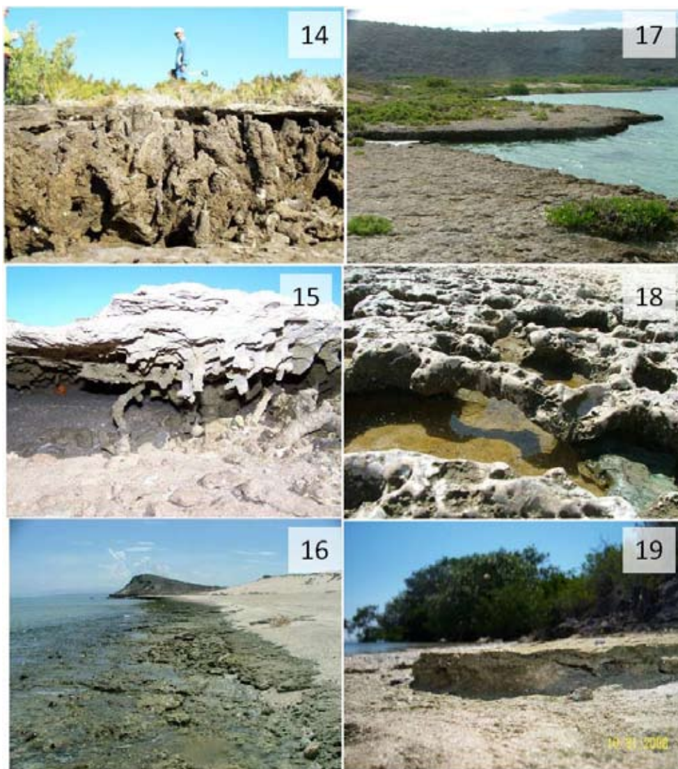
Figures 14-19. Pro-thrombolithic structures in different localities of B. C. S.: 14) Extensive platform with thick root like formations in the upper intertidal of El Mogote; 15) Lithified platform with fragile rhizolite system in the upper intertidal of El Mogote; 16) Thrombolithic platform on the exposed east coast intertidal of Isla Espíritu Santo; 17) Thrombolithic platforms in a cove on the west coast of Isla Espíritu Santo; 18) Bridge-like thrombolithic structures (ca. 25 cm) adjacent to mangroves on the west coast (San Carlos, B.C.S.); 19) Incipient pro-thrombolith at Isla San José.

support the proposed hypothesis that a transitional structure existed. However, this has to be more accurately stated, because the transitional structures between mats and thrombolites are pro-thrombolites, while in the observed structures they were past the pro-thrombolithic stage (more consolidated) and mats in which cyanobacterial sheaths are still present and thus represent separate geological events.