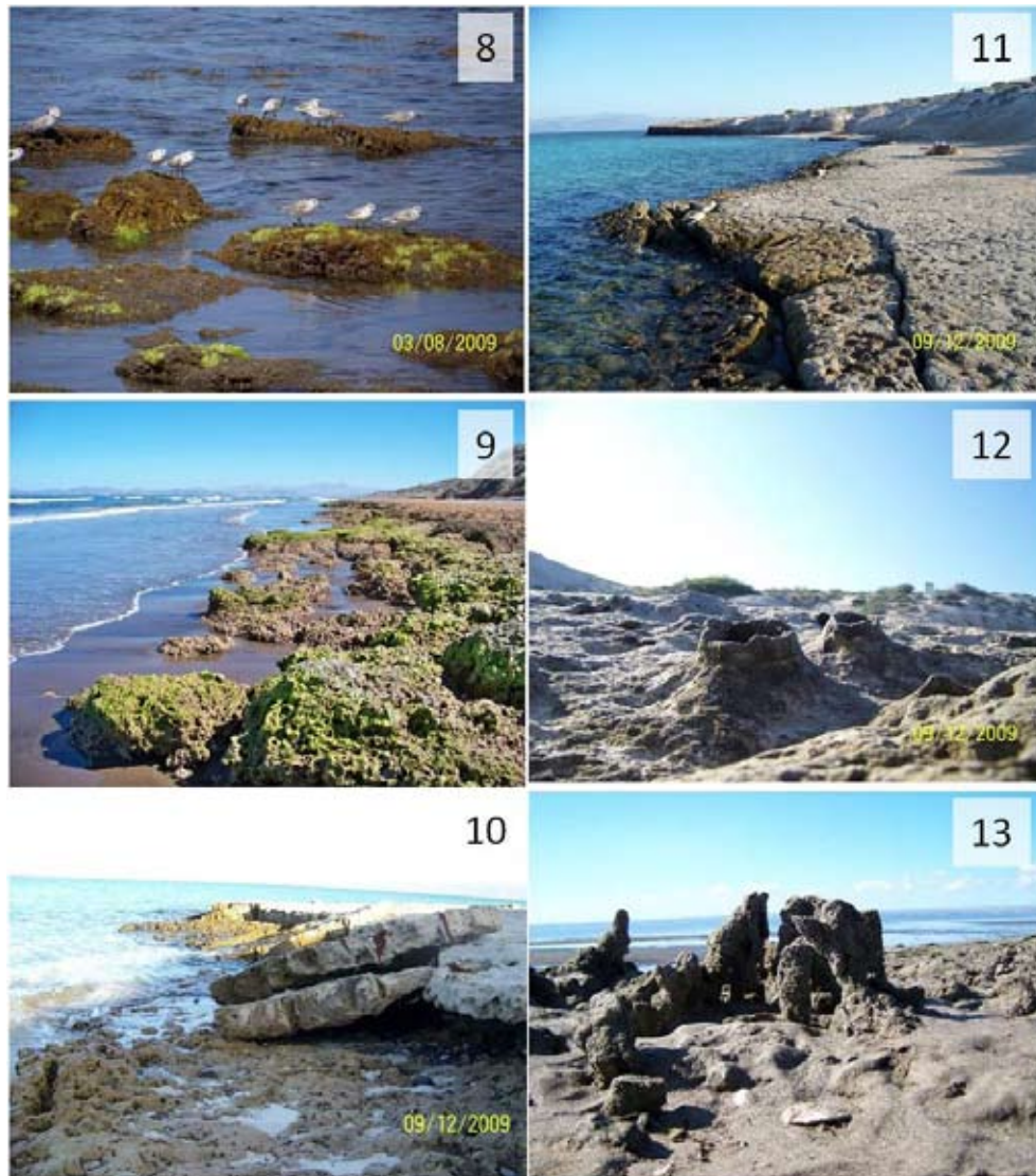
Figures 8-13. Thrombolitic formations in different localities of Bahía de La Paz, B.C.S., Mexico: 8) Blocks in the intertidal covered by green macroalgae at high tide at Las Brisas; 9) Thrombolitic formation in the intertidal covered by green macroalgae during low tide at Las Brisas; 10) Non-lacunar thrombolitic platforms where two separate episodes can be identified based on the two layers of beach-rock platforms at Calerita; 11) Thrombolitic platforms showing perforations at Calerita; 12) Close up of perforations in thrombolitic blocks at Calerita ; 13) Fragile rhizolith-like structures in the lower intertidal of El Mogote, La Paz lagoon.

structures (Fig. 25) may be observed in the beach areas free from mangrove cover, appearing as platforms limiting the sandy areas. Their fragmentation to different degrees is evident. In the mangrove areas dense microbial mats are conspicuous, closely associated to the Laguncularia racemosa root systems and, just behind the mangrove line, evidences of the transition from mat to pro-thrombolite can be found. Extensive soft discolored mats (Fig. 26) are found fused with the consolidated thrombolitic structure (Fig. 27).