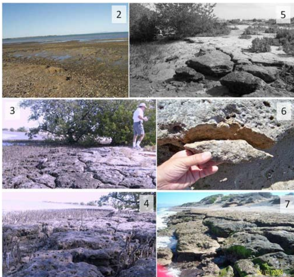
Figures 2-7. Microbial structures located in the Bahía de La Paz, B.C.S., Mexico, mainly inside the lagoon: 2) Extensive cyanobacterial mats (far view) and pro-thrombolitic platform (close view) in Centenario SW margin of La Paz lagoon; 3) Fragmented pro-thrombolite platform supporting mangroves ( Avicennia germinans ) in Marina Sur; 4) Eroded platform showing channels in Marina Sur; 5) Detached blocks with eroded bases in Marina Sur that remind of the bun shaped stromatolites of Shark Bay, Australia; 6) Structures showing the same clotted matrix and sheet cover as other pro-thrombolitic platforms in Marina Sur; 7) Non-lacunar thrombolitic blocks and platforms showing smooth surfaces covered with cyanobacteria at Las Brisas north outside of the lagoon.

ous in various sites, either as exposed (Fig. 16) or protected (lacunar) platforms (Fig. 17), and lithified bridge-like structures (Fig. 18). In Isla San José, however, pro-thrombolitic formations seemed incipient, associated to thick microbial mats (Figs. 19-20). Further exploration is required at Isla San José inasmuch formation of sandbars, very similar to El Mogote in La Paz lagoon, suggest past pro-thrombolitic activity in several sites.