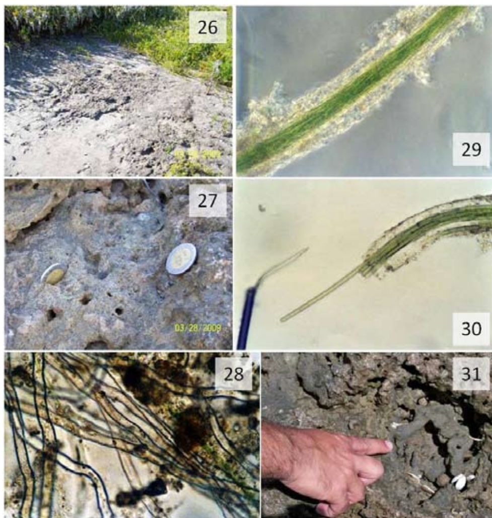
Figures 26-31. Early stages of pro-thrombolitic development in the west coast of B.C.S., Mexico: 26) Soft conglomerating cyanobacterial mats drying in the intertidal area at San Carlos beach, B.C.S, alongside the “transitional” pro-thrombolitic formation; 27) Transition from soft conglomerated mats (embedded coin) fused to consolidated pro-thrombolitic formation (laid coin) in San Carlos; 28) Photomicrograph of empty Microcoleus chthonoplastes sheaths acting as scaffold in the transitional pro-thrombolite mat from San Carlos in Bahía Magdalena (200x); 29) Filament of Microcoleus chthonoplastes from San Carlos showing thick sheaths (400x); 30) Trichome from Microcoleus chthonoplastes filament at 630x from San Carlos; 31) Soft bridge-like pro-thrombolitic mat (ca. 20 cm) structure (scaffold) at San Carlos.

In the above scenario, activity would continue as long as a cyanobacterial cover remained on the conglomerated sediment platforms (prothrombolite) that is subject to tidal flooding, in which case the precipitated micrite would be forced through the cyanobacterial mesh during ebb tide, depositing between the sand grains and gradually cementing them.