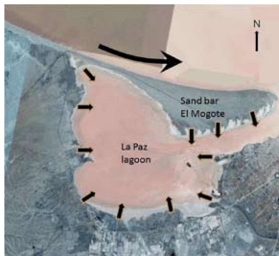
Figure 37. La Paz coastal lagoon in the southern Baja California peninsula. Large arrow indicates the growth of the sand-bar along approximately 6000 years. Small arrows indicate pro-thrombolithic accretion along the internal margins of the lagoon, based on recorded platforms and extensive cyanobacterial mats.

Based on the above along with reports of pro-thrombolites from Laguna San Ignacio in the western coast of the Baja California peninsula (Siqueiros-Beltrones et al. , 2008), and the observations in Bahía Magdalena we further support the hypothesis that microbial mats through pro-thrombolithic ground formation may have promoted the generation of coastal lagoons throughout NW Mexico. Thus, as more information becomes available, Lovelock’s