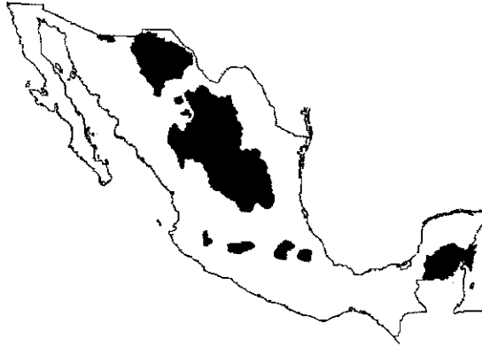
Figure 2. Allocation of the most important endorheic basins in Mexico. (Modified from Reyes, 1979).

\text{g.l}^{-1} ), mesohaline ( 20\text{-}50 \text{ g.l}^{-1} ) and hypersaline ( >50 \text{ g.l}^{-1} ).